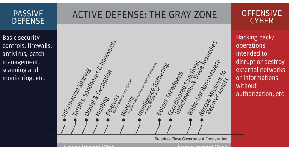
Figure 6: The Continuum Between Defensive and Offensive Cyber Operations

The push towards active defence. One of the most vociferously debated issues in cyber security governance is "active defence." The idea of active defence is still very much under debate and the legal demarcation of the concept determines whether certain behaviour in cyber defence is considered legal or illegal. "Hacking back," which is considered to be offense, should not be used interchangeably with active defence, although it is precisely the notion of retaliatory hacking back that makes the debate so crucial. A 2016 report by the Centre for Cyber and Homeland Security<sup>21</sup> plots a number of cyber operations on a continuum between passive cyber defence and offensive cyber operations, indicating a grey zone between defence and offense (See Figure 1).